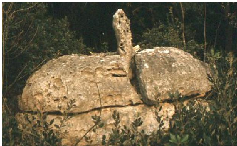
Figure 7. Standing stone vertically fitted in a natural fissure of the rock with a natural hole in its top end. This stone is about 30 meters away from the building in figure 3.

About 30 m southeast from the casella is located a large rocky outcrop characterized by a fracture some centimetres wide and several centimetres deep, cutting through the hole outcrop. This is at the edge of a steep slope facing east toward the upland plain of the Månìe. The fracture hosts an isolated standing stone with a hole in its top end (fig. 7).