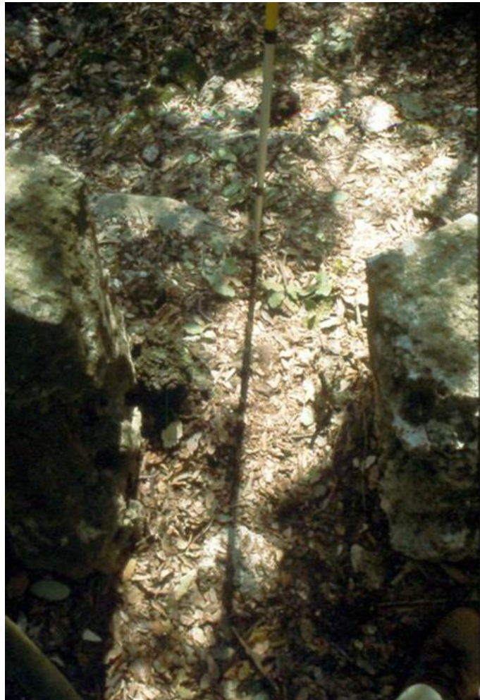
Figure 10. Shadow of the gnomon when it is positioned in between the two standing stones represented in figure 7. At the time in which this image was taken, the time of the local (or true, or astronomical) noon was 12:33:22 on 23 rd March 2003 (local const.: 12:26:40; equation of true time on 23 rd March 2003: +06:42).