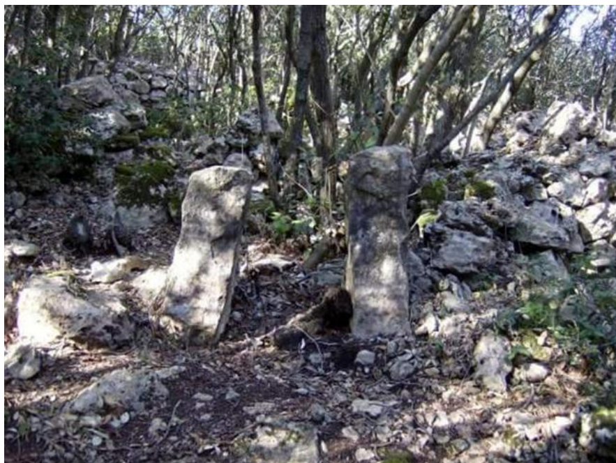
Figure 6. The two standing stone located near the southern wall of the building in figure 3. The stones are 44 cm apart.

The south space outside the casella is occupied by two walls about 65 cm thick, built almost perpendicularly to the south wall of the main structure. All together, these walls surround an area of 1.85 x 2.42 m, which is adjacent to the main compartment of the building but inaccessible from it. The only access to this small space was probably located in the south side, currently partially destroyed. The only existing remains on this side of the construction are two short standing stones 0.44 metres apart that stand out from the rest of the walls (fig. 6).