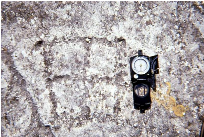
Figure 1. Cruciform petroglyphs at Ciappo de Cunque.