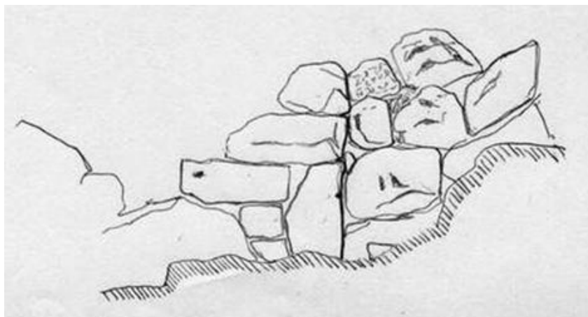
Figure 4. Sketch of the elevation representing the interruption in the fabric of the south wall that could be related to an opening (such as a door) or a corner of an earlier layout of the building.

Thickness of the north and east walls measured on their top is of about 0.85 m, whereas the south wall is about 1.10 m thick (thickness of the west wall at the time of the survey could not be measured precisely because of some debris covering its central part). Space available inside the building is about 8 m long and 4 m wide.