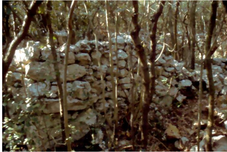
Figure 5. East wall of the "casella" built without the use of mortar.

Walls are preserved for up to 2 m above the ground and are made of stones of various sizes, laid without mortar (fig. 5). Stones were sourced locally and used without specific preparation. Stone alignments within the walls are irregular and characterized by a high number of voids. Cornerstones are generally bigger than the other stones. Overall, the building technique can be described as inaccurate and attributed to non-specialized builders.