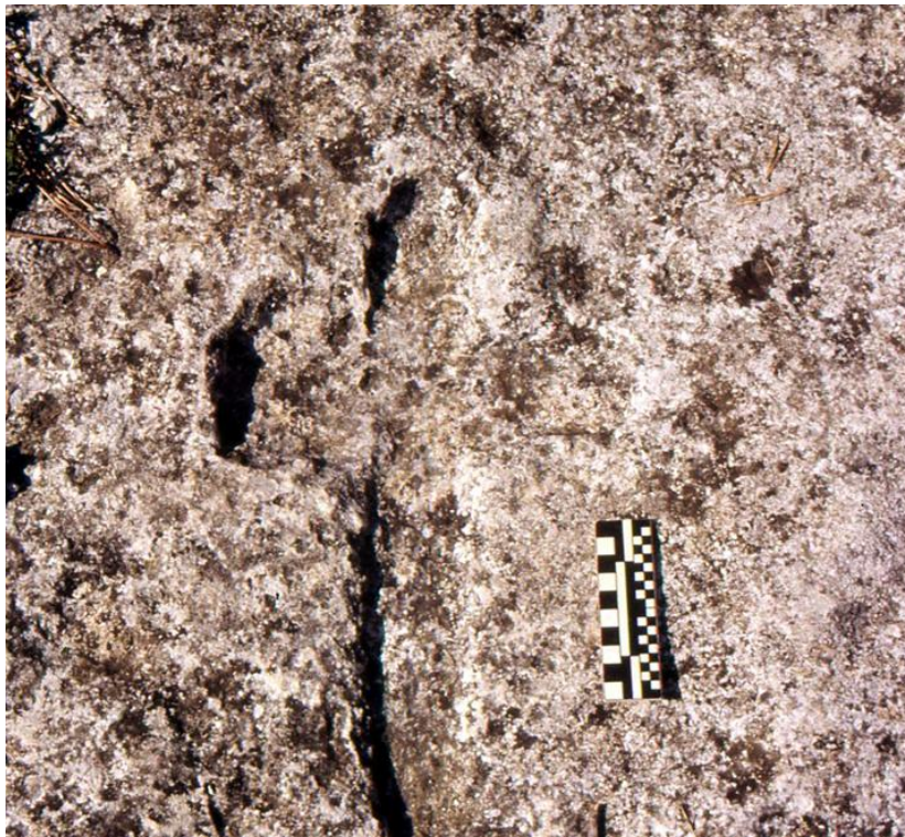
Figure 2. Cruciform petroglyphs at Ciappo dei Ceci.