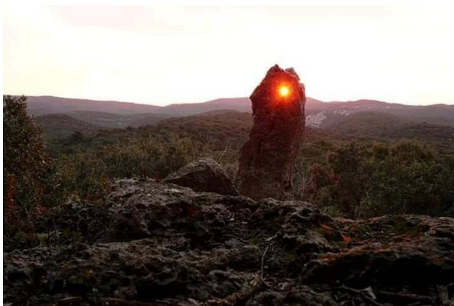
Figure 9. The point of light created by the sun when observed through the hole from some distance from the stone and at the equinoxes' sunrises.

Measurements taken with a prismatic compass Wilkie of the horizontal arch visible through the hole when the compass sight is placed against the hole (e.g. fig. 8) is 74^{\circ} - 93^{\circ} .